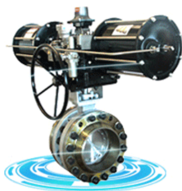
Triple offset butterfly valve