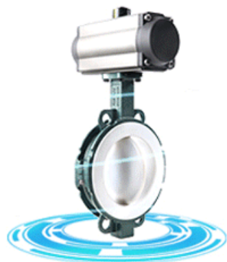
PTFE lined butterfly valve