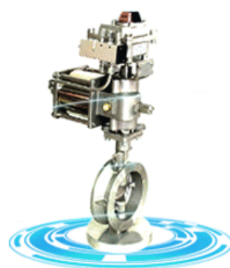
Double offset butterfly valve