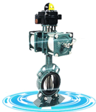
Resilient seat butterfly valve