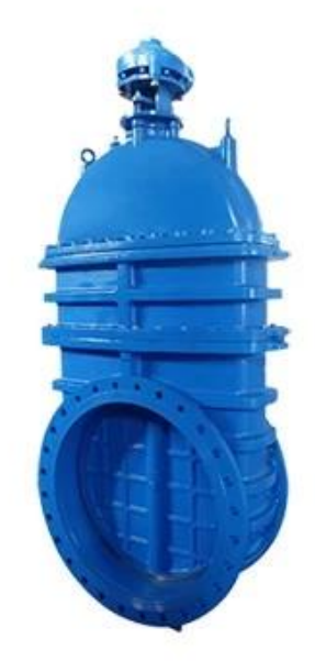
LARGE DIAMETER METAL SEATED GATE VALVE DN700-DN2000,PN10/16/25