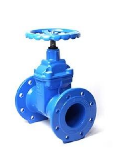
SMALL DIAMETER GATE VALVE DN50-DN300,PN10/16/25