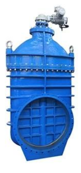
METAL SEATED GATE VALVE DN350-DN600,PN10/16/25