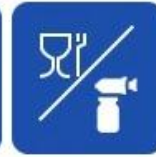
Food and drug