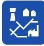
Water supply and drainage