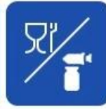
Food and drug