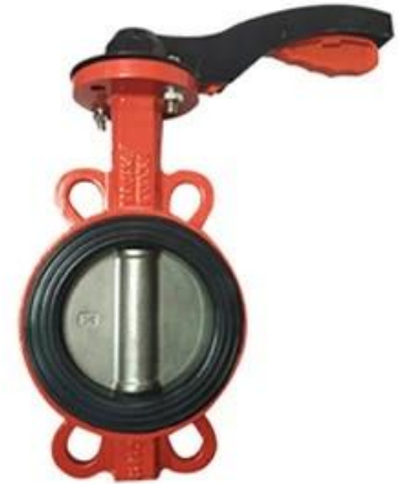
Resilient seat butterfly valve