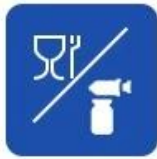
Food and drug