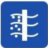
Sea water desalination