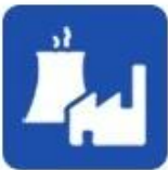
Industrial water application