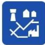
Water supply and drainage