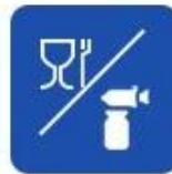
Food and drug