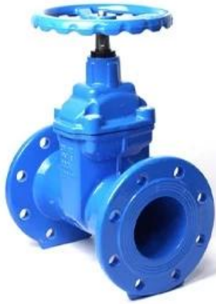
SMALL DIAMETER GATE VALVE DN50-DN300,PN10/16/25