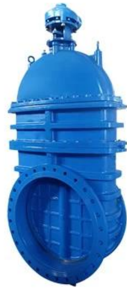
LARGE DIAMETER METAL SEATED GATE VALVE DN700-DN2000,PN10/16/25