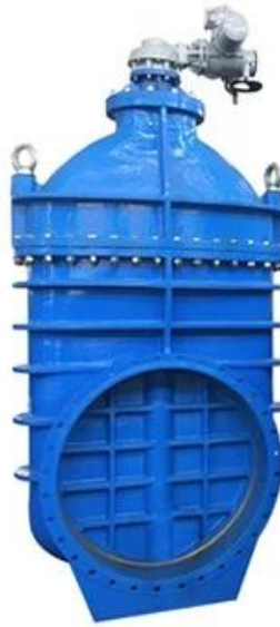
METAL SEATED GATE VALVE DN350-DN600,PN10/16/25