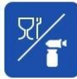
Food and drug