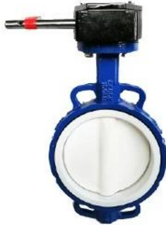
PTFE Butterfly Valve