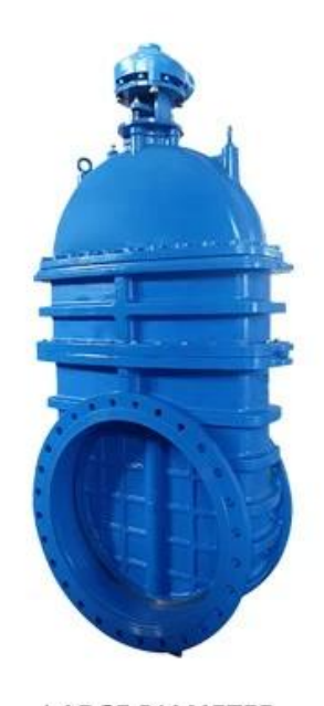
LARGE DIAMETER METAL SEATED GATE VALVE DN700-DN2000,PN10/16/25