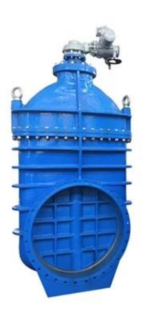
METAL SEATED GATE VALVE DN350-DN600,PN10/16/25