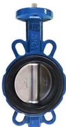
Resilient seat butterfly valve