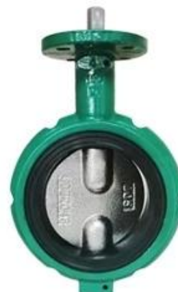
Short-neck butterfly valve for petroleum