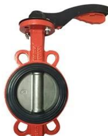
Resilient seat butterfly valve