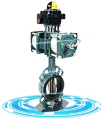
Resilient seat butterfly valve