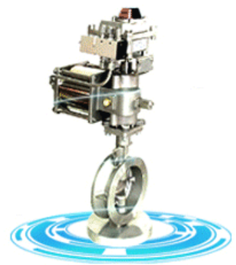
Double offset butterfly valve