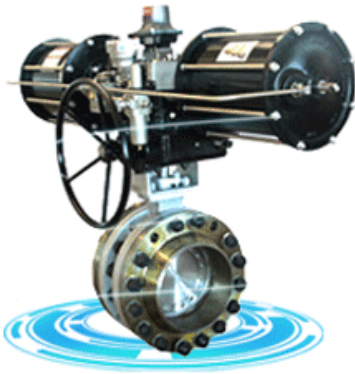
Triple offset butterfly valve