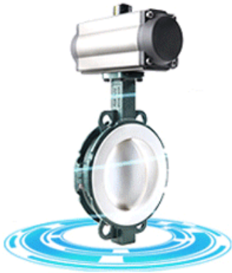
PTFE lined butterfly valve