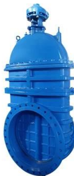
LARGE DIAMETER METAL SEATED GATE VALVE DN700-DN2000,PN10/16/25