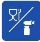
Food and drug