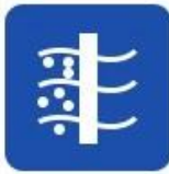
Sea water desalination