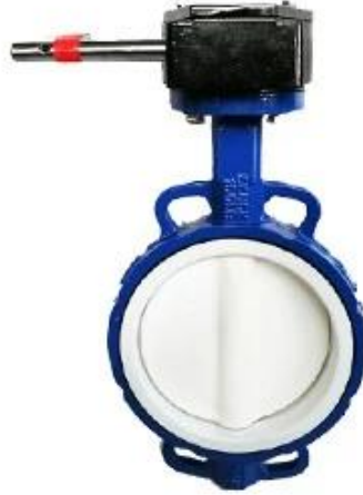
PTFE Butterfly Valve