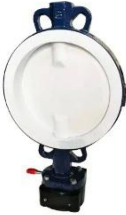
PTFE Butterfly Valve