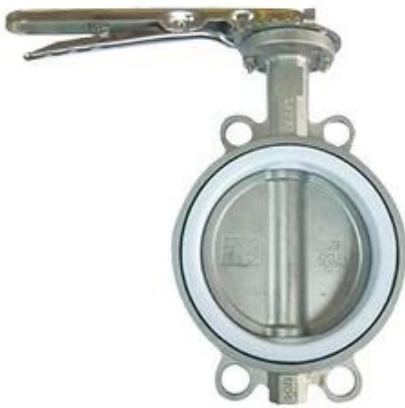
PTFE Butterfly Valve