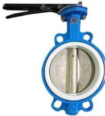
PTFE Butterfly Valve