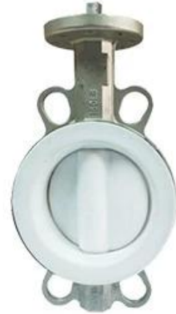
PTFE Butterfly Valve