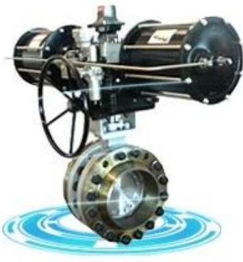
Triple offset butterfly valve