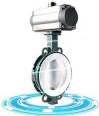
PTFE lined butterfly valve