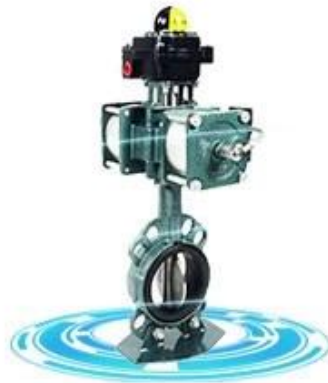
Resilient seat butterfly valve