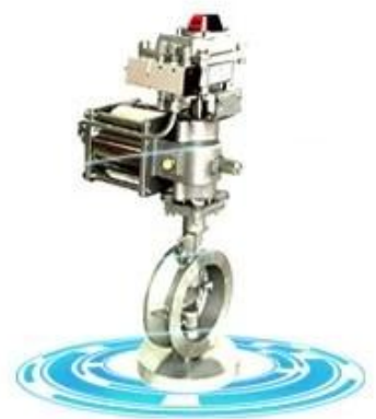
Double offset butterfly valve