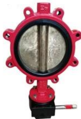
Resilient seat butterfly valve