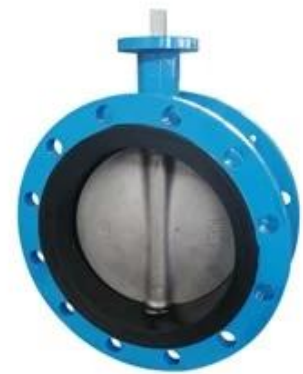
Double flange resilient seat butterfly valve