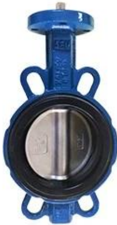
Resilient seat butterfly valve