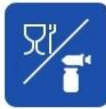
Food and drug