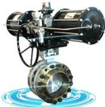
Triple offset butterfly valve