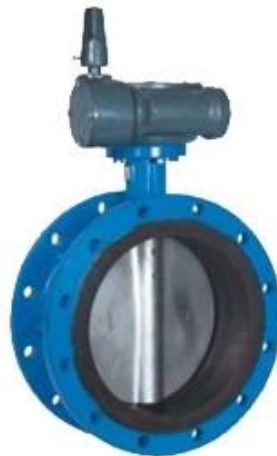
Double flange resilient seat butterfly valve