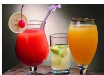
Drink & Beverage