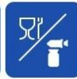
Food and drug