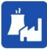
Industrial water application