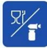
Food and drug