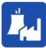
Industrial water application