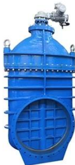
METAL SEATED GATE VALVE DN350-DN600, PN10/16/25