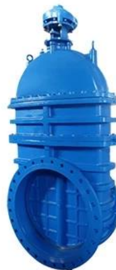
LARGE DIAMETER METAL SEATED GATE VALVE DN700-DN2000, PN10/16/25