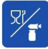
Food and drug