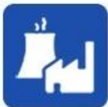
Industrial water application