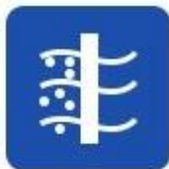
Sea water desalination