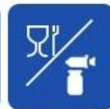
Food and drug