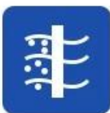
Sea water desalination