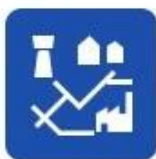
Water supply and drainage