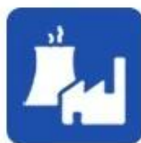
Industrial water application