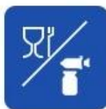
Food and drug