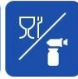
Food and drug