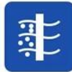
Sea water desalination