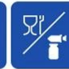
Food and drug