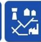
Water supply and drainage