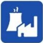
Industrial water application