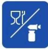
Food and drug