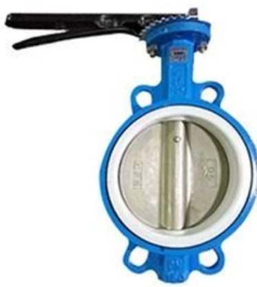
PTFE Butterfly Valve