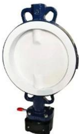
PTFE Butterfly Valve