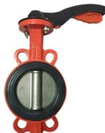
Resilient seat butterfly valve