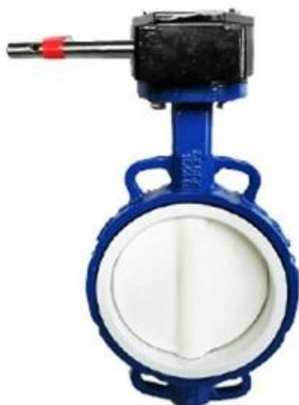
PTFE Butterfly Valve