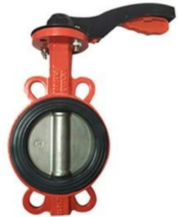
Resilient seat butterfly valve