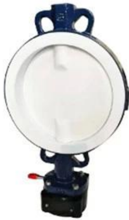
PTFE Butterfly Valve