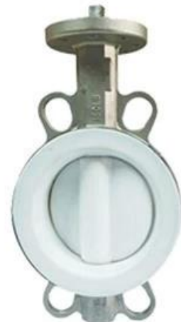
PTFE Butterfly Valve