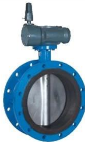
Double flange resilient seat butterfly valve