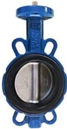
Resilient seat butterfly valve