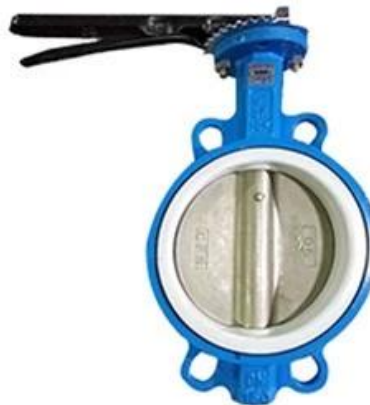
PTFE Butterfly Valve