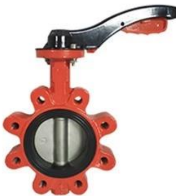
Resilient seat butterfly valve