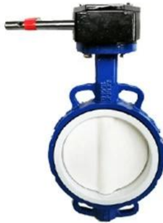
PTFE Butterfly Valve