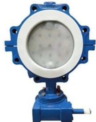
PTFE Butterfly Valve