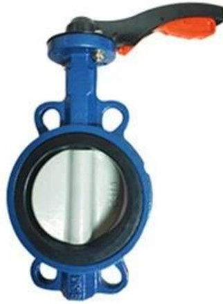
Resilient seat butterfly valve