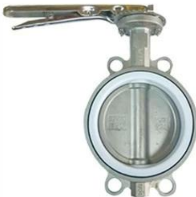
PTFE Butterfly Valve