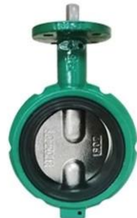
Short-neck butterfly valve for petroleum