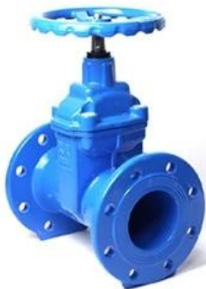
SMALL DIAMETER GATE VALVE DN50-DN300, PN10/16/25