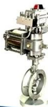
Double offset butterfly valve