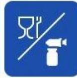
Food and drug