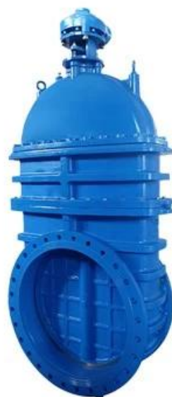
LARGE DIAMETER METAL SEATED GATE VALVE DN700-DN2000,PN10/16/25