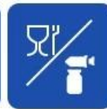
Food and drug