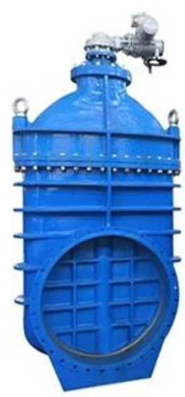
METAL SEATED GATE VALVE DN350-DN600,PN10/16/25