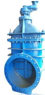
RKS SMALL DIAMETER GATE VALVE DN50 - DN300, PN10 / 16 /25