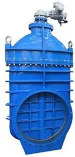
METAL SEATED GATE VALVE DN350-DN600,PN10/16/25