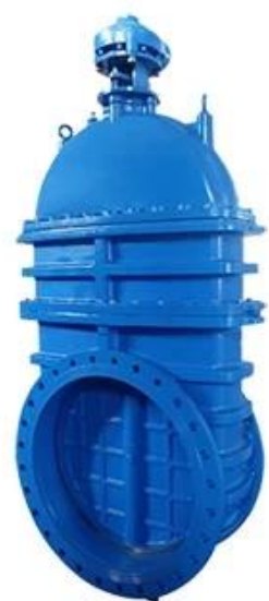
LARGE DIAMETER METAL SEATED GATE VALVE DN700-DN2000,PN10/16/25